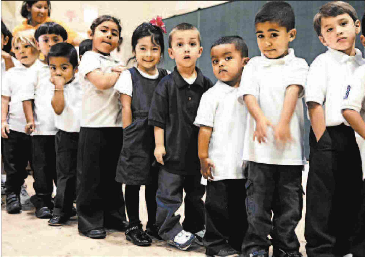
Preschoolers line up for recess at Chicago's Edwards Center for Young Learners. Illinois is the first state to require public schools with pre-school programs to offer a bilingual education to children who don't speak English.