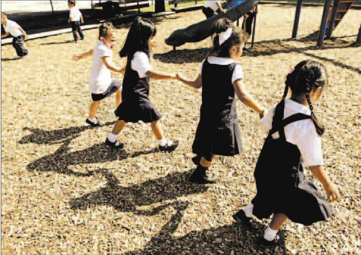
Students play outside at the Southwest Side's Edwards Academy for Young Learners. Illinois is the first state to require bilingual programs for preschoolers.