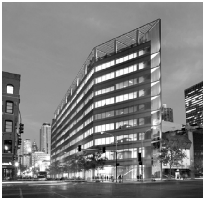
Erikson will own the first three floors of this new high-rise with a dedicated entrance on LaSalle Street shown in this view.