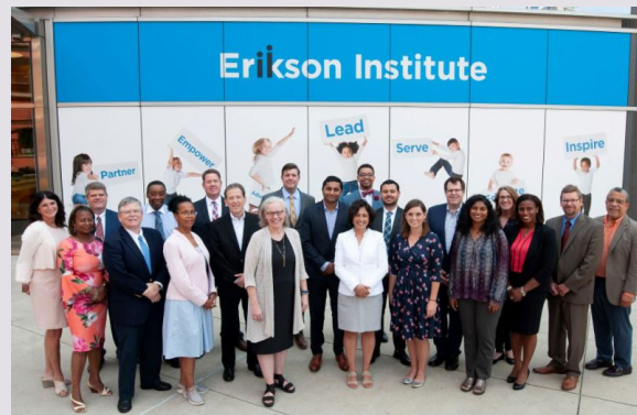
2018 McCormick Foundation Executive Fellows cohort.